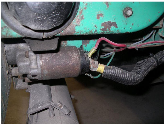
12 Volts (Red)

Remove fuel line from the carburetor and run the line into a container to catch the gas.