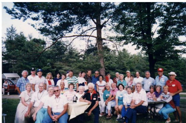
The First HC Rally in 1989